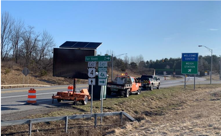
Rte. 4 Fair Haven