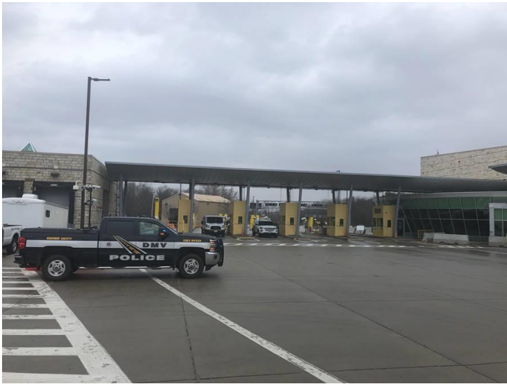
I89 Highgate POE