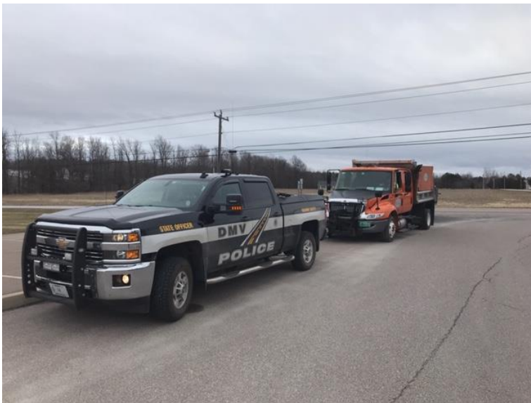
Lake Champlain Ferry Landing in Grand Isle