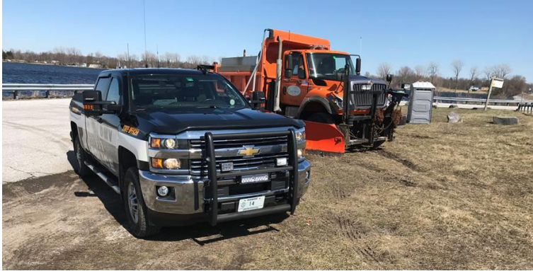
Rte. 2 Alburgh